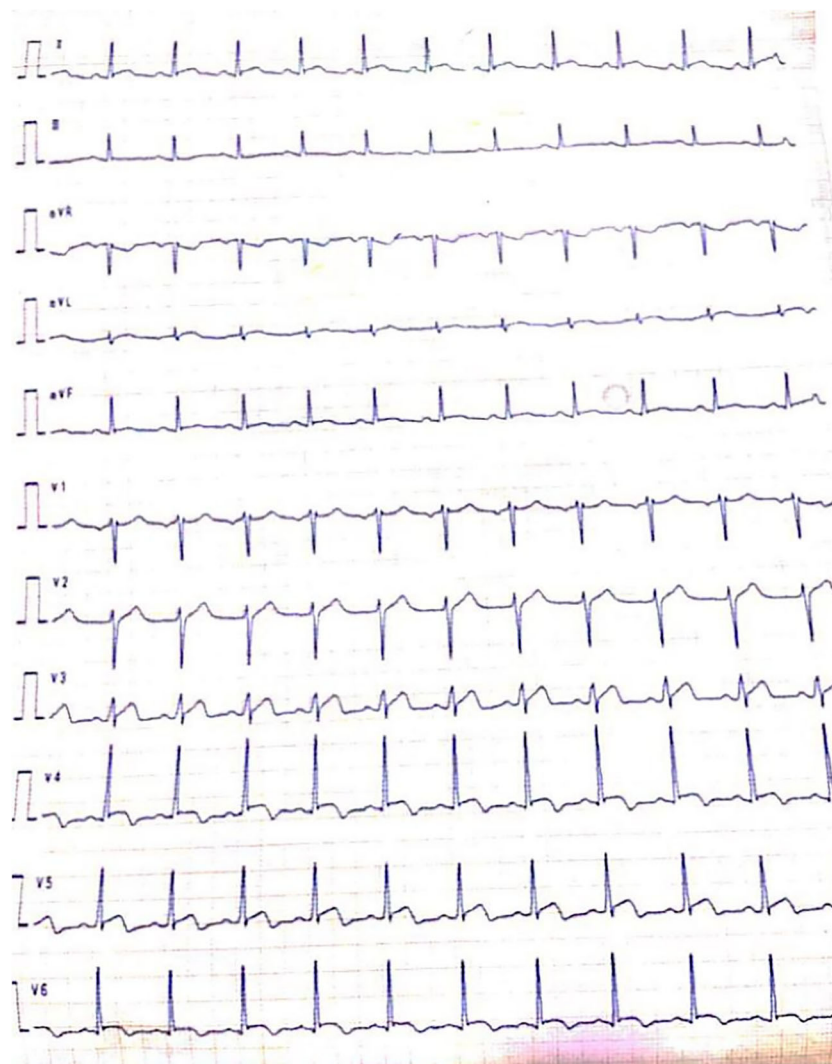
Figure 1 An electrocardiogram showed ST-segment elevation in precordial leads.

CRP, C-reactive protein; ESR, erythrocyte sedimentation rate.